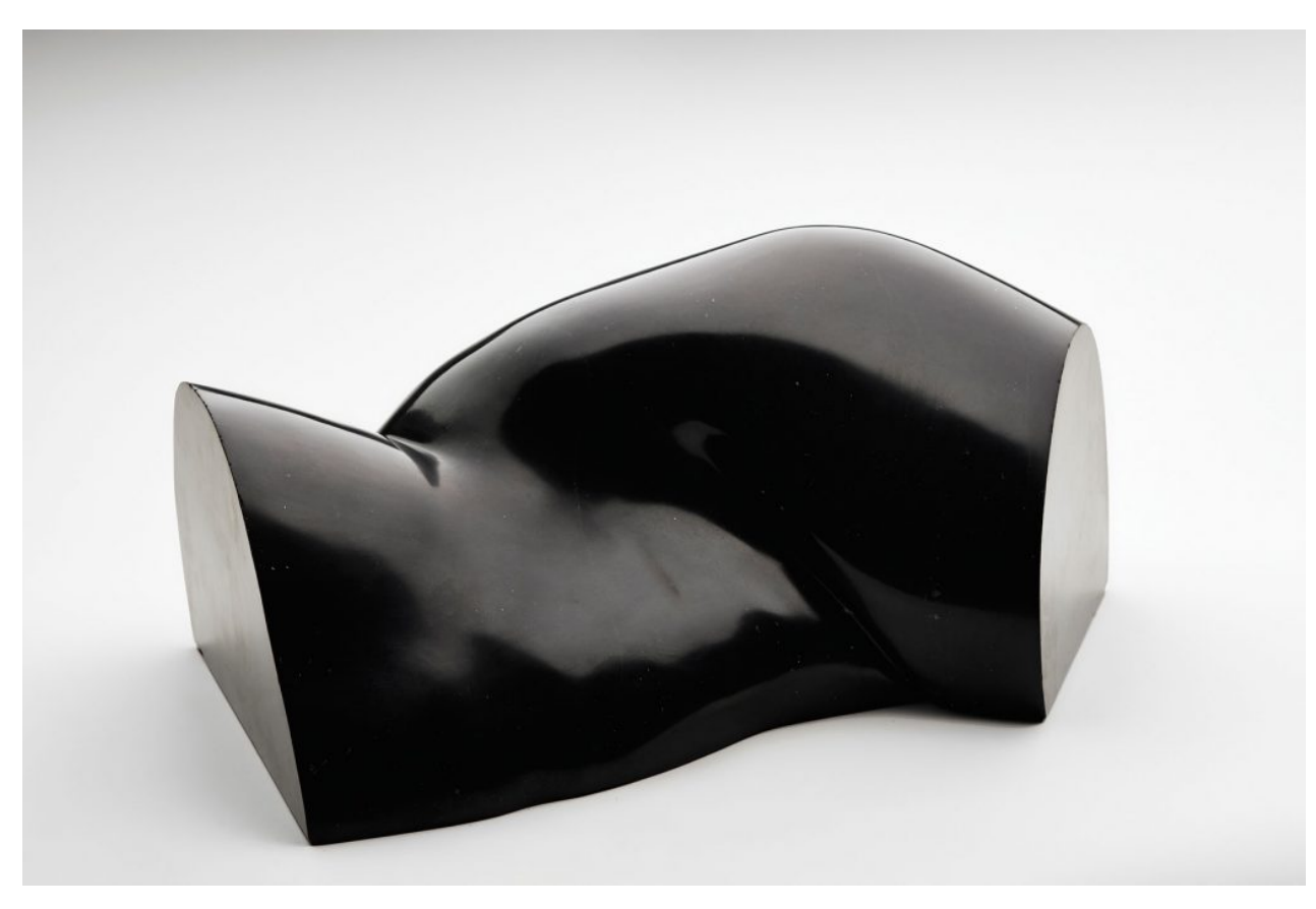
Lake Balaton, 2013. Kilkenny limestone, 26 cm. high.