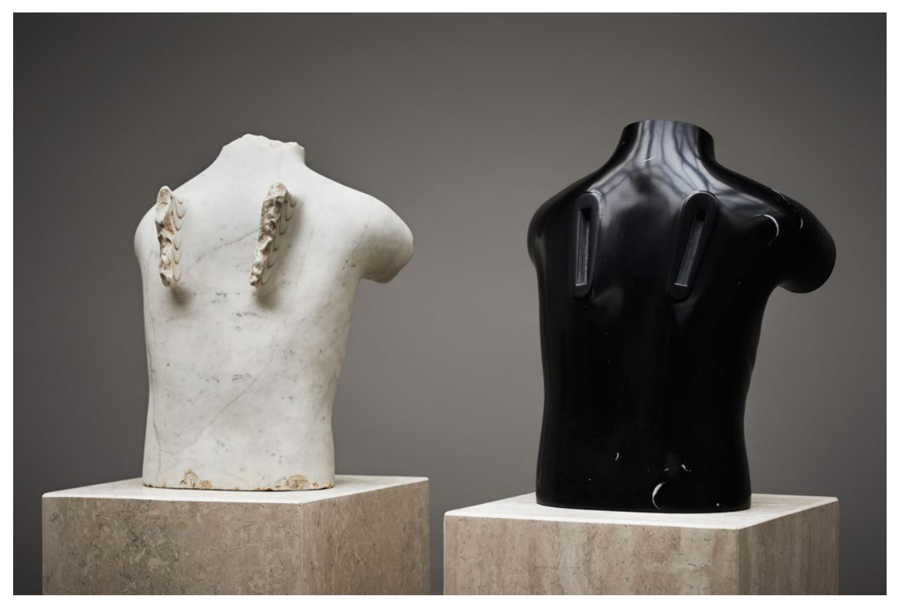
Me & the Devil , 2015. Carrara marble and Kilkenny limestone, 50 cm. high.

Ellis, aware of the danger that he might be labeled a "copyist," began asking himself whether these works truly carried emotive force or if they were just reproductions. To satisfy himself, he shifted direction again, this time bringing an element of Surrealism to the fore. In Me S the Devil (2015), carved from marble and Kilkenny limestone handpolished with wet sand, two armless and headless torsos rest on separate plinths. One is white, with jagged, uneven cuts at the arms and neck, as if it had just been found in an excavation. The other is black, and its cuts are pristinely clean and polished, as in a Duchamp-Villon. When the sculptures are viewed from the rear, the white torso has two bruised ridges running down its shoulder blades, as if wings had been brutally ripped off its back, whereas the black torso bears two long slits (not unlike the incisions in Giacometti's works from the late '20s), as if wings had been mechanically attached. We have yin and yang, a "good" angel and a "bad" angel, classicism and Modernism.