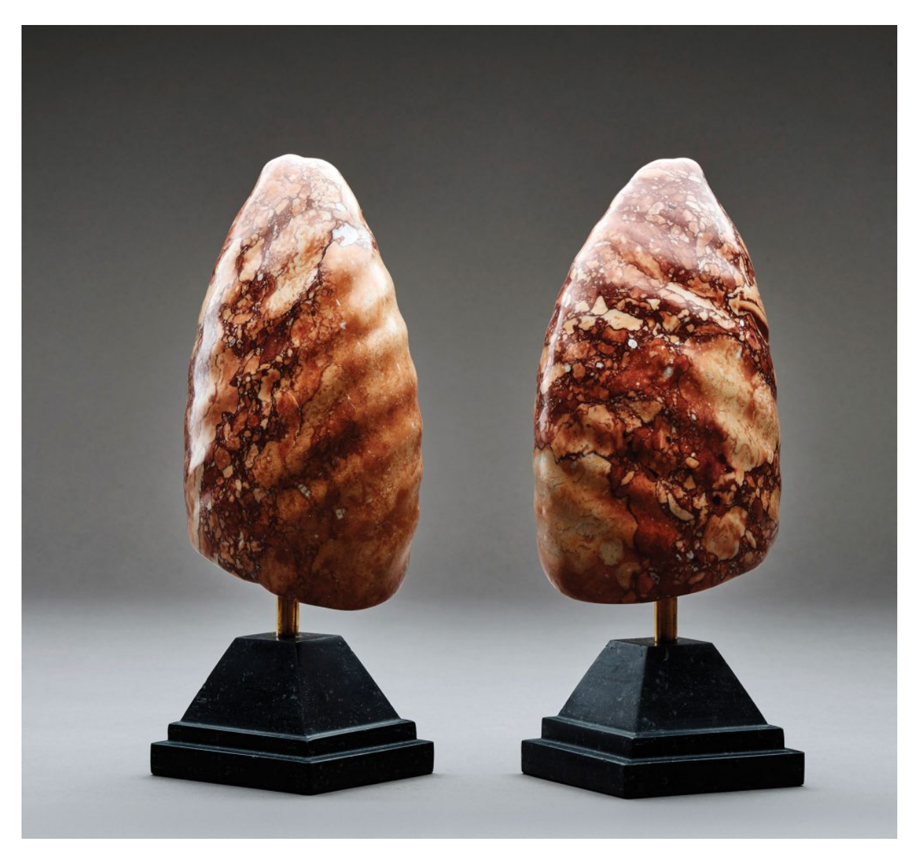
Breathe, 2015. Cork red and Kilkenny limestones, 32 cm. high.